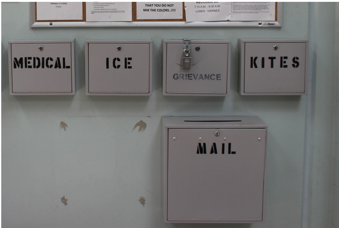
Detainees can leave anonymous complaints in locked mailboxes at the Adelanto ICE Processing Center in Adelanto, Calif., July 2016.

In another report, a detainee in Louisiana said she had asked staff for a grievance form, “which was given to her, but the staff refused to provide a pen or pencil to write it.”