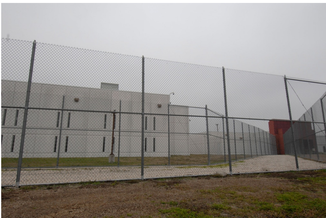
The privately operated T. Don Hutto detention center in Taylor, Texas, has long been entangled in

That warning was soon followed by dozens, and then hundreds, of abuse reports.